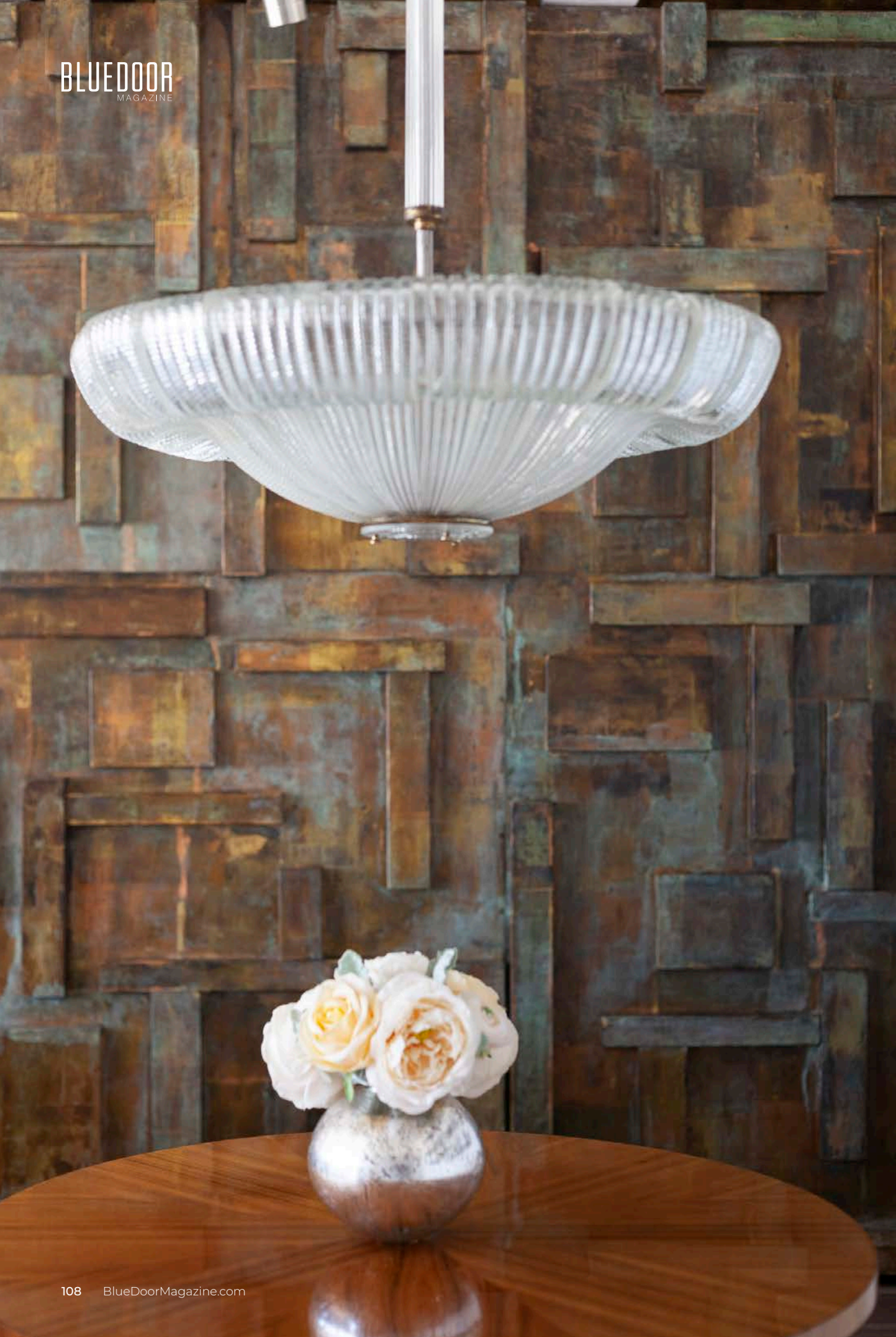
A sculptural wall by artist Nathan Slate Joseph wraps the stairwell.