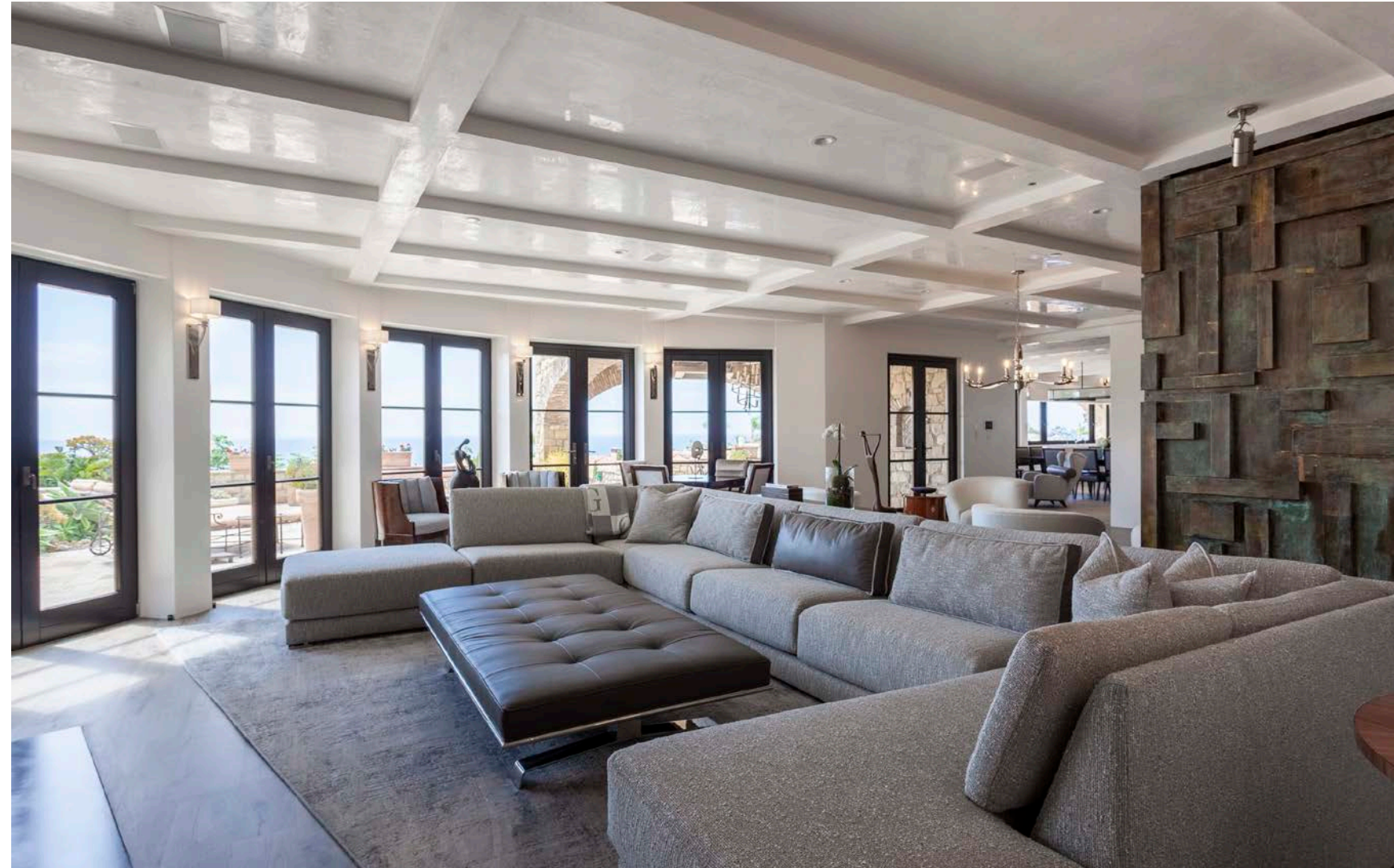
The great room offers breathtaking views of the ocean from a couch custom-designed with entertaining in mind.

Those views include one of the home's most impressive features, an art wall that wraps around the central staircase. The wall was created and installed by New York artist Nathan Slate Joseph. His sculptural galvanized steel work is painted, stained, and molded to create a stunning and timeless installation.