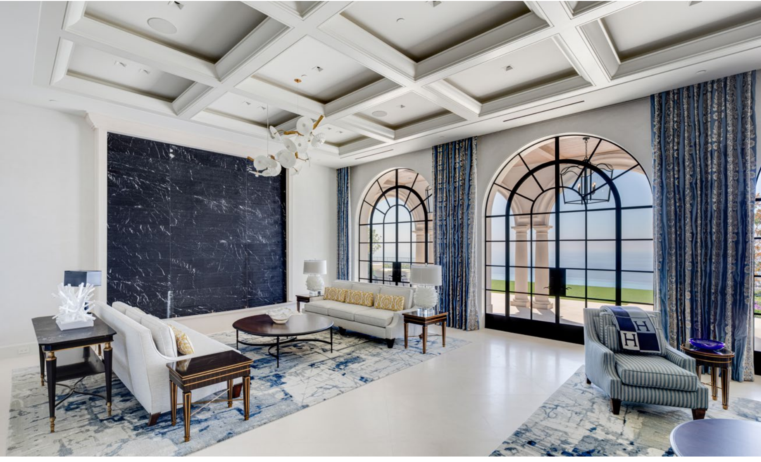
A large-scale, black marble fountain in the formal living room creates a striking design statement as well as an auditory experience designed to complement the ocean views. The room's overhead lighting piece is designed by Sue Capelli.

spaces and more intimate ones. The grand foyer, where mirrored, sweeping staircases make for a cinematic opening act, Capelli heightened that sense of drama with white limestone floors inlaid with a black pattern. Above, a large-scale chandelier designed by Capelli cascades down from an inset ceiling. Nearby, the formal living room echoes that elevated style with large-scale seating and a largely symmetrical floor plan. On one wall, Capelli installed a massive marble fountain. "We wanted to hear the sound of water," she says. "When you open the doors and see the ocean and hear the water, it is very serene and peaceful."