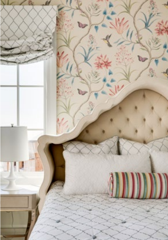
In both the primary suite and guest bedrooms, Capelli created garden-inspired, whimsical environments with soft tones, hand-painted and embroidered wall coverings, and a mix of tactile fabrics.

Sue Capelli Passione Inc. 9550 Research Drive Irvine 949.336.7800 passioneinc.com