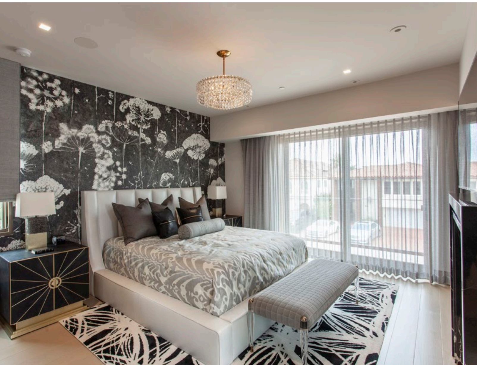
Clockwise from above: The guest suite goes big on bold patterns and rich materials, including a dramatic wallcovering from Phillip Jeffries that plays off an equally dramatic rug by Stark. Big-moment details include custom lighting, shagreen nightstands, stack stone walls, and geometric tile by Ann Sacks used in the guest bathroom.

And while Capelli relied mostly on earth tones for both finishes and furnishings, she also injected moments of glamour throughout. In one upstairs bedroom suite, she gathered a collection of black and white patterns in textiles, wallcoverings, and tile to create a subtle nod to her own take on maximalism.