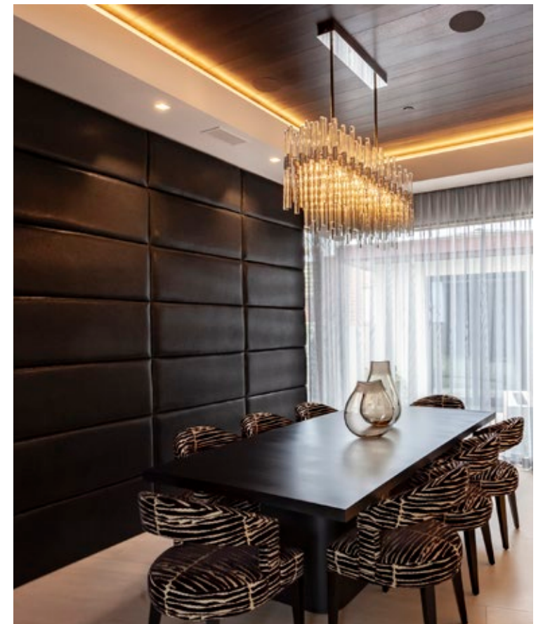
Clockwise from above: Stack stone surrounds an expansive wine room, while Capelli brought drama throughout the home, including a statement-making grand piano and a custom-designed dining table surrounded by chairs upholstered in textiles by Rubelli.

Sue Capelli Passione Inc. 9550 Research Drive Irvine 949.336.7800 ext. 200 passioneinc.com