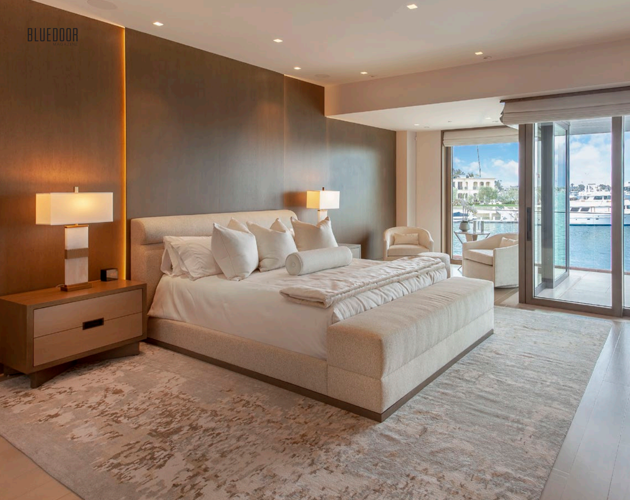
Above: In the master suite, Capelli designed a cocoon-like bed upholstered in textiles from Sahco. The rug is from Stark.