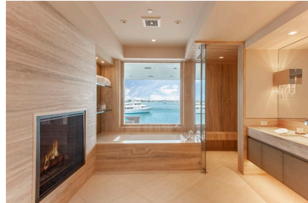
Opposite: The master bath goes big on luxuries, including a fireplace and front-row yacht views.

In the world of exceptional Newport Beach real estate, Linda Isle stands out from other communities for its ultra-exclusivity. The horseshoe shape of land is an actual island, only connected to Newport via a bridge where a guard gate keeps the island highly private. With just over 100 homes, all are waterfront, and all come with docks, often slips large enough to accommodate residential-sized yachts. Homes rarely sell for below eight figures and can fetch as much as $7,000 a square foot for this extremely rarefied slice of island life.